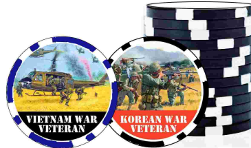
Attending Veterans Receive a Commemorative Challenge Chip

Local Veterans can meet with vendors who will inform them on the latest products, services and healthcare benefits available to them. For more information visit: www.VeteransFestival.org